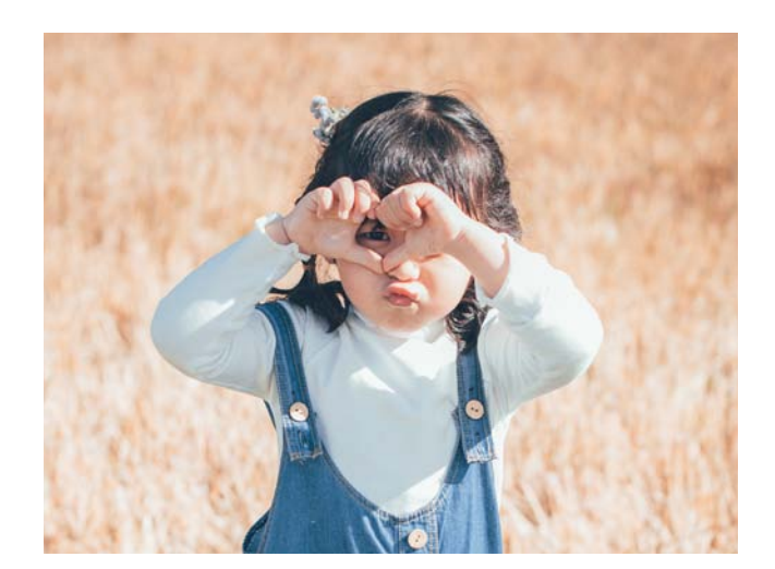
eviDent Foundation Annual Report 2018/19

Tooth decay is preventable, but parents of children with heart disease experience many barriers to accessing the dental care their kids need. Our project will break down these barriers by equipping parents and clinicians with