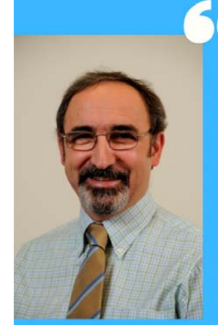
My participation as a general practitioner both challenges me intellectually and satisfies my enjoyment in a way that can fit into my busy schedule.

Identifying patients with BDD is important before irreversible treatment is carried out due to high levels of dissatisfaction, poor patient-centred outcomes and the question of whether these individuals have the capacity to consent.